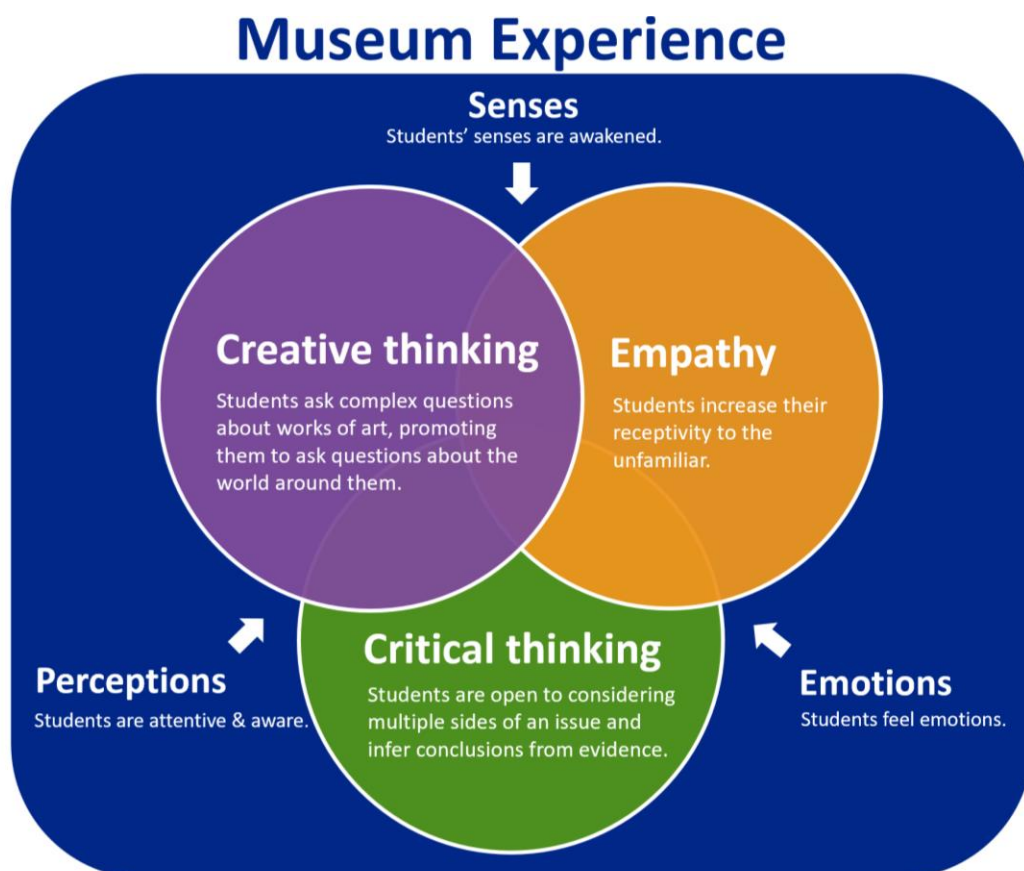
Figure 2. Visualizing the effects of a single-visit art museum field trip on students

American Art (Greene et al., 2014) and a national study spearheaded by the Museum Education Division of the National Art Education Association (NAEA) and the Association of Art Museum Directors (AAMD) (RK&A, 2018). 4 Collectively, the studies show that even a one-time museum experience significantly complements the visual arts education students receive in school because the single-visit program benefits students in three capacities 5 essential to their well-being after graduation: creative thinking, empathy, and, to some extent, critical thinking. The illustration in Figure 2 depicts our understanding of how one-time art museum programs affect students in these three capacities: creative thinking, empathy, and critical thinking. While each capacity is distinct, cognitive psychology and neuroscience indicate that they do not occur in isolation from one another—instead, they are interconnected (Terrassa et al., 2016).